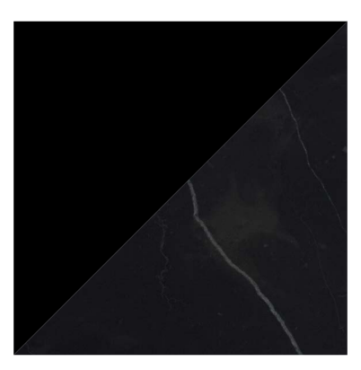
Black / Black Marble