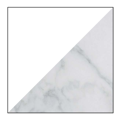
White / White Marble