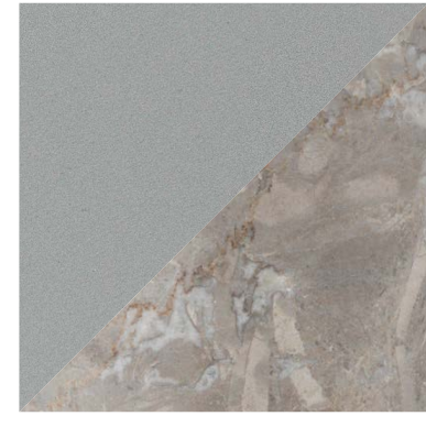
Grey / Grey Marble