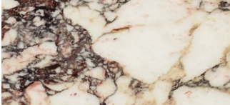
CALACATTA VIOLA MARBLE