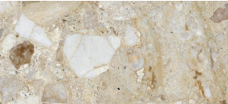
KUNIS BRECCIA STONE