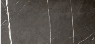
GREY KENDZO MARBLE