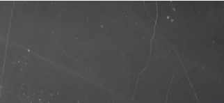
NERO MARQUINA MARBLE