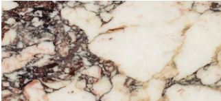
CALACATTA VIOLA MARBLE