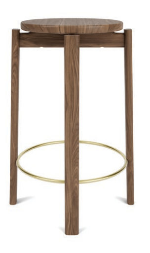
WALNUT WITH BRASS RING 9120879