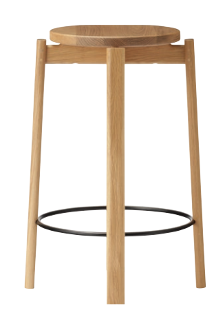
NATURAL OAK WITH BLACK RING 9120039

Counter stool in solid, lacquered walnut or FSC<sup>™</sup>-certified solid, lacquered oak. Available with black, brushed steel or brass foot ring. Flat packed for easy self-assembly.