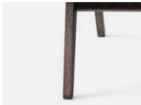
DARK STAINED OAK