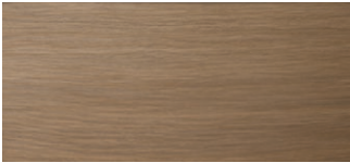
DARK STAINED OAK