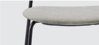
BLACK POWDER COATED STEEL