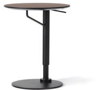
DARK STAINED OAK 1105849