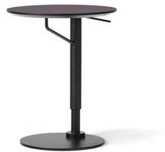
LINOLEUM CHARCOAL 1105539

Whether used as an occasional table or a temporary workstation, the height adjustable Branch Side Table adapts to changing needs, offering a versatile and seamless solution for dynamic living spaces. Its compact and flexible design allows it to be conveniently pushed close to a sofa or chair, optimising space, while its black steel base and charcoal linoleum or dark-stained oak tabletop add a touch of sophistication in a quality that ensures it withstands the demands of daily use.